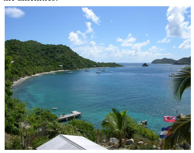
Manchioneel Bay, Cooper Island, BVI

Relax, swim and snorkel/scuba dive, read, or watch daily life at Manchioneel Bay. This small piece of paradise provides island living at its best. Our 50ft Open-Plan Living Area and west-facing panoramic view showcase spectacular sunsets over Tortola and the Sir Francis Drake Channel. Experience self-sufficient island living without giving up all the amenities.