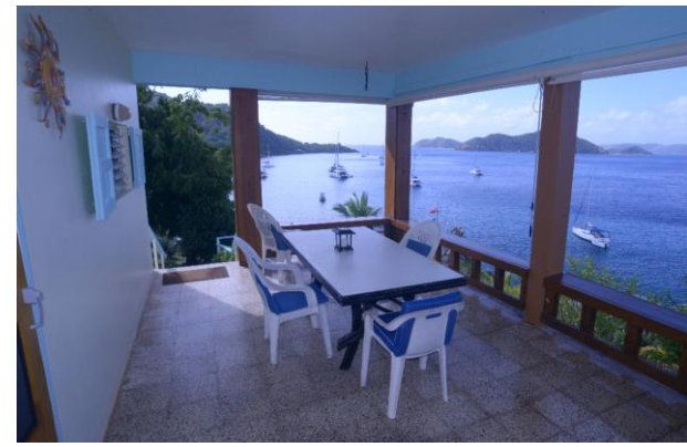
Open Air Dining

The house is arranged as two distinct living areas joined by the front porch and courtyard and is perfect for three couples, two couples with children or a single large family. The highlight of this house is the Open-Plan Main Living area on the front porch. The open-air dining and living room area provide dramatic views of Manchioneel Bay and the Sir Francis Drake Channel.